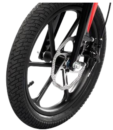
Dual Disc Brakes