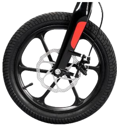
16" Air-Filled Tires